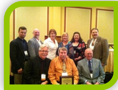
The CoAEMSP Volunteers and Staff

A special recognition was bestowed on the Committee on Accreditation of Education Programs for the Emergency Medical Services Professions (CoAEMSP) during CAAHEP's Annual Meeting. The CoAEMSP made historic efforts this past year to meet the mandate from their communities of interest to provide a single pathway for educational accreditation. Faced with an influx of programs seeking accreditation to meet the deadline for this new requirement, the CoAEMSP showed great ingenuity and determination to accommodate the public interest and the needs of their profession while maintaining the standard of quality required by CAAHEP. The mission of CAAHEP is "to assure quality health professions education to serve the public." The efforts put forth by CoAEMSP and the result of that effort support this mission. Therefore the CoAEMSP was recognized for their efforts with a CAAHEP President's Citation. Traditionally presented to an individual, this is the first time a President's Citation has been awarded to a team.