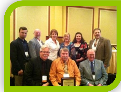
The CoAEMSP Volunteers and Staff

A special recognition was bestowed on the Committee on Accreditation of Education Programs for the Emergency Medical Services Professions (CoAEMSP) during CAAHEP's Annual Meeting. The CoAEMSP made historic efforts this past year to meet the mandate from their communities of interest to provide a single pathway for educational accreditation. Faced with an influx of programs seeking accreditation to meet the deadline for this new requirement, the CoAEMSP showed great ingenuity and determination to accommodate the public interest and the needs of their profession while maintaining the standard of quality required by CAAHEP. The mission of CAAHEP is "to assure quality health professions education to serve the public." The efforts put forth by CoAEMSP and the result of that effort support this mission. Therefore the CoAEMSP was recognized for their efforts with a CAAHEP President's Citation. Traditionally presented to an individual, this is the first time a President's Citation has been awarded to a team.